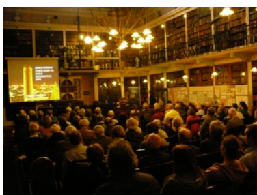
Meeting Room, Academy House