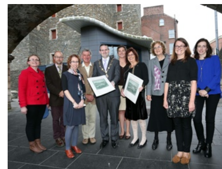
Launch party at the Tower Museum

Derry City Mayor, Councillor Martin Reilly, launched the 'Digital Atlas of Derry-Londonderry' in the Tower Museum, Derry on 11 September 2013. The digital atlas is a joint collaboration between the Royal Irish Academy, Derry City Council and Queen's University, Belfast. It is an experimental web-GIS resource that uses content from the Irish Historic Towns Atlas, no. 15, Derry-Londonderry by Avril Thomas (2005). The launch was associated with Derry-Londonderry UK City of Culture 2013 and the 3 rd Annual Digital Arts and Humanities Institute and Culture TECH 2013. It is free to use and available at www.ria.ie/digitalatlasderry