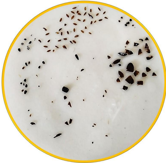
Moynagh Lough Palaeo-environmental early medieval insects